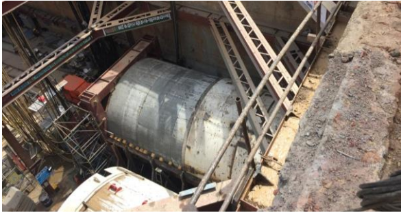
■ Assembly shaft