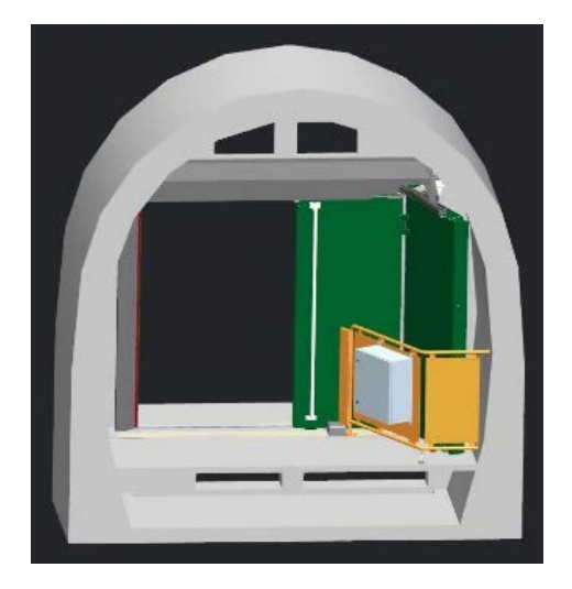
Figure 2. 3D virtual twin of the safety door

Tunnel operation also does not have to be interrupted for the training of operator personnel. All functions of the door, such as normal opening sequence, blockages in opening and closing direction and behavior in case of power failure can be simulated in the digital twin.