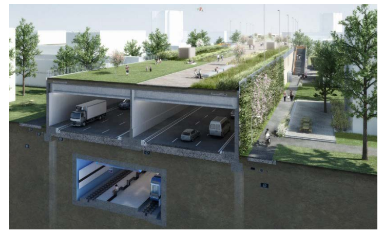
Figure 7. Visualisation of the Schwamedingen Tunnel

A tunnel ventilation simulator has been developped, which was successfully used as a proof of concept in the collaboration with Siemens on the Roveredo bypass project. Thanks to its innovative modelling system, the HBI simulator allows for interaction with the controller and the realtime visualisation of the results. The advantages of using the digital twin for automation are also recognised. This is because it is not just the ventilation components that are being simulated – the controllers can also be mapped using the virtual PLCSIM Advanced controller in the TIA Portal. Various scenarios can thus be simulated and tested before the devices are installed on site.